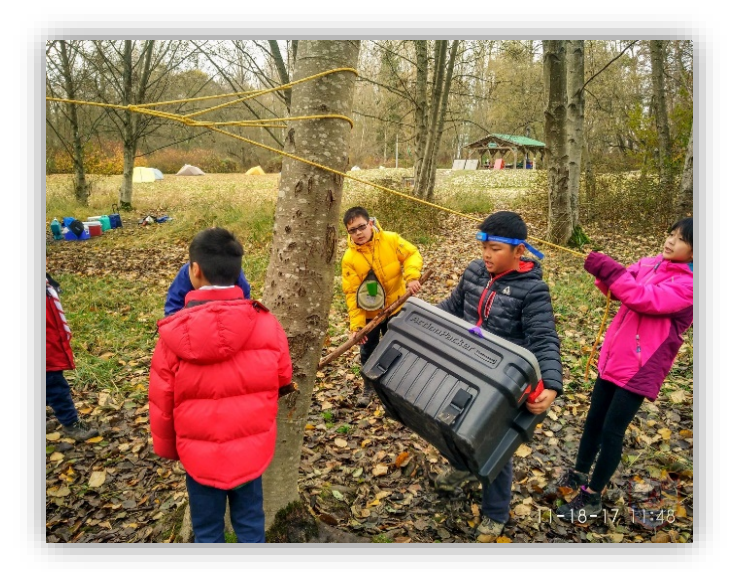
2. Scouts practicing and resetting their shelter area at kickoff camp

Kickoff Camp taught the youth a variety of skills over the weekend. They learned the basic knots as well as lashings to create structures. Using these knots, they also learned how to set up a shelter between trees as their gathering place and kitchen. The Troop learned how to cook in the backwoods with ingredients such as